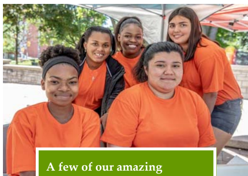
A few of our amazing volunteers