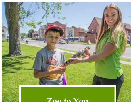
Zoo to You