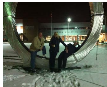
Team Cupid - Durham College

dearsantadurham for more information and to take a peek at some of the fun we all had last year. Tickets are $60 each. Tickets will be available for purchase online and in person.